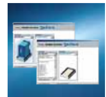
oneTrack™ Soft Count software interface