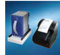
Cashbox is docked on one of four stations