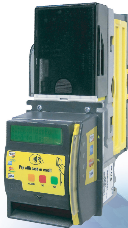
Tap-and-go contactless payment technology

CPI offers a total payment system package for consumers and operators in the 4-in-1 Plus acceptor.